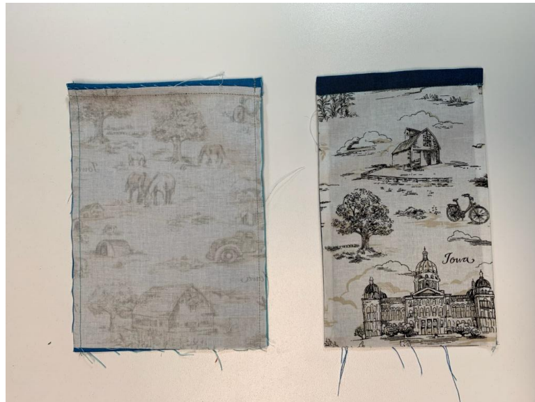
Making Pocket Diagram