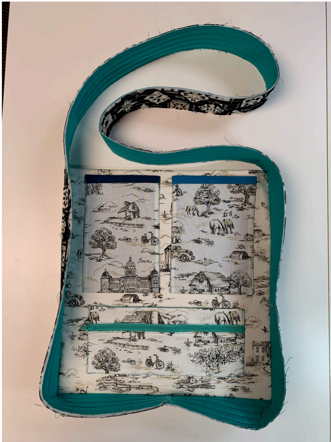
Attaching Bag Handle Diagram