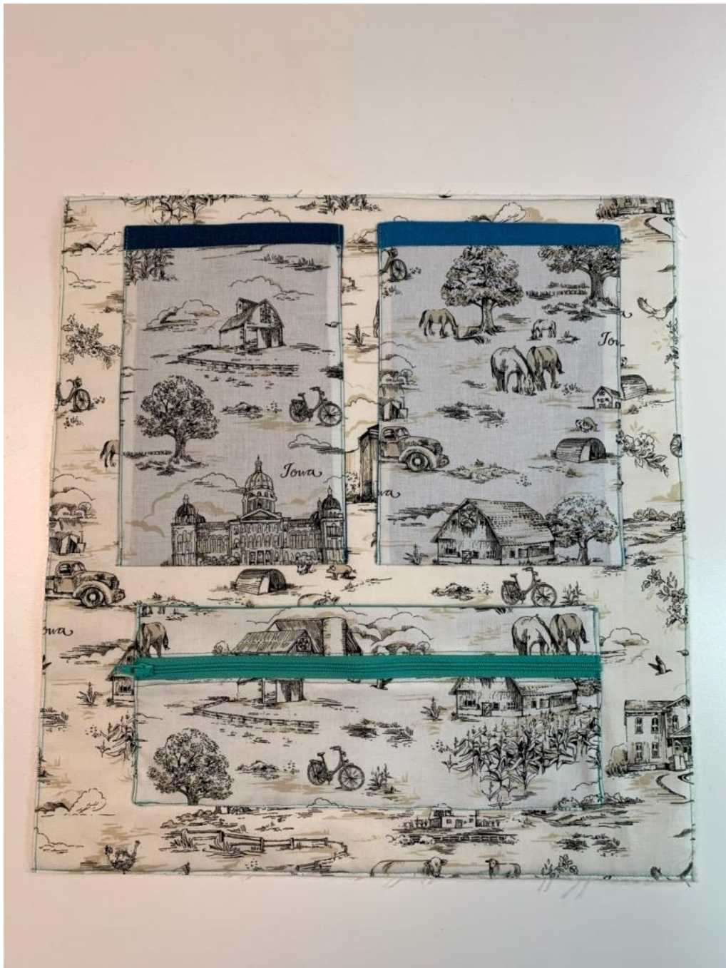
Attaching Pocket Diagram